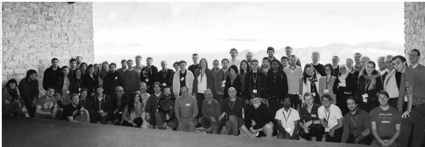
Figure 2. The School group photograph looking across Bonagia Bay.

physics and cosmology were presented by Marcella Marconi, Laura Inno, Matteo Monelli and Massimo Dall’Ora. A comprehensive review of surveys for transient and variable objects was given by Michel Dennefeld together with current and future strategies for spectroscopic follow-up of transients.